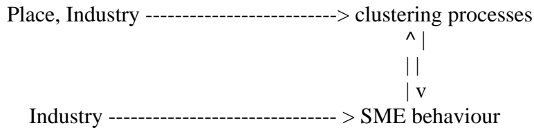
Figure 4 Clustering and SME behaviour

In the above model, clustering behaviour is determined directly by industry, place and SME behaviour. Conversely, SME knowledge creation is determined directly by industry and by the personal characteristics of actors. Thus, if place and industry affect clustering processes and if industry affects SME clustering behaviour and knowledge exchange, arguably there is always a degree of interdependence (simultaneity) between SME behaviour and clustering processes.